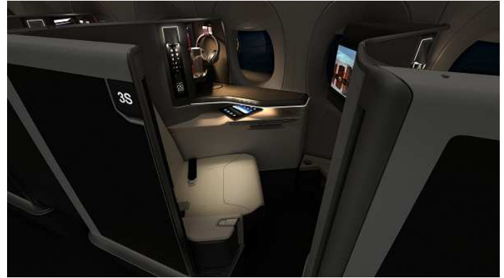
Versa @Safran Seats

Safran is an international high-technology group, operating in the aircraft propulsion and equipment, space and defense markets. Safran has a global presence, with more than 92,000 employees and sales of 21 billion euros in 2018. Safran is listed on the Euronext Paris stock exchange, and is part of the CAC 40 and Euro Stoxx 50 indices.